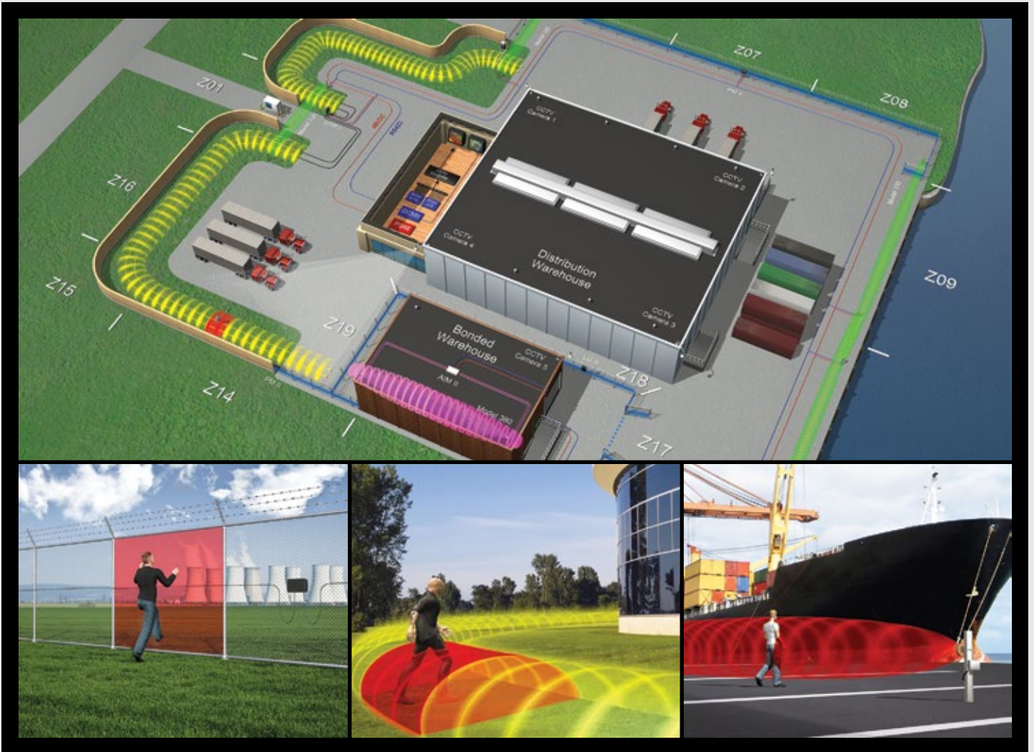
MicroPoint™ II Fence Detection System